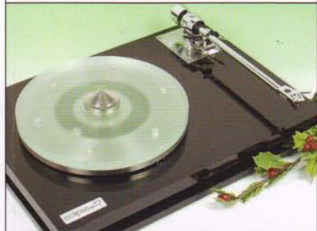
INSPIRE ECLIPSE SE12 turntable