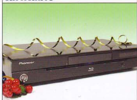
PIONEER BDP-LX53 Blu-ray player