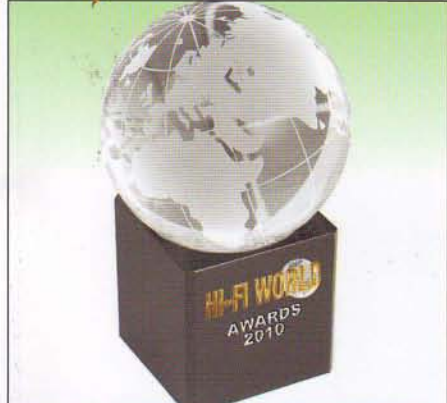
HI-FI WORLD AWARDS